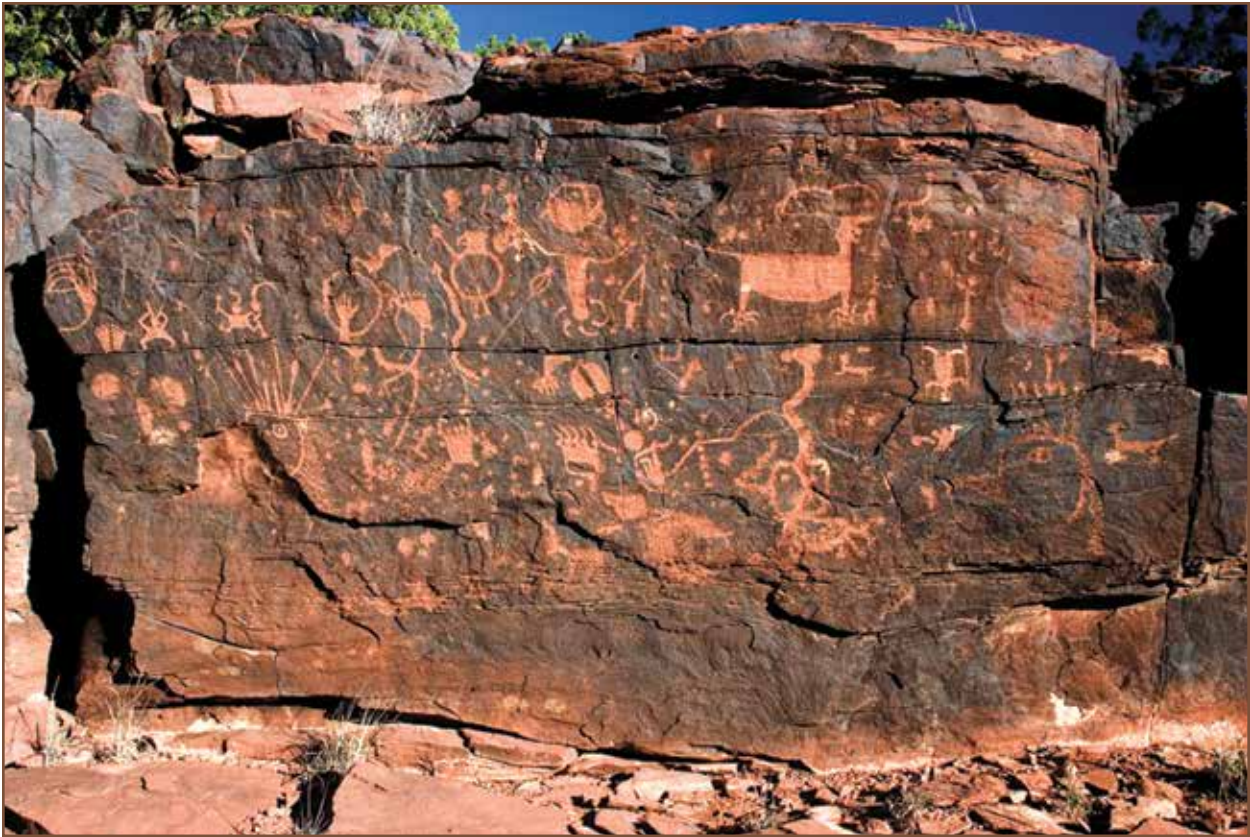
PETROGLYPH 1 - Large panel

color. The Moquis (Hopis) of Arizona utilized pinion pitch and oil extracted from pumpkin seeds as binders (Bourke 1884:120). Ruth Bunzel (1973:859-861) states that among the Zunis, ceremonies sometimes accompanied the procurement and manufacturing of certain pigments. She says kaolin (white) was common and readily available. Three types of black were used: one was mineral, one oxide of manganese; and the others were vegetable: one carbonized corncobs, and a fungus found in corn. Bunzel reports yellow was made from yellow ochre; bright yellow flowers (such as buttercups); and also from corn pollen mixed with boiled yucca juice.