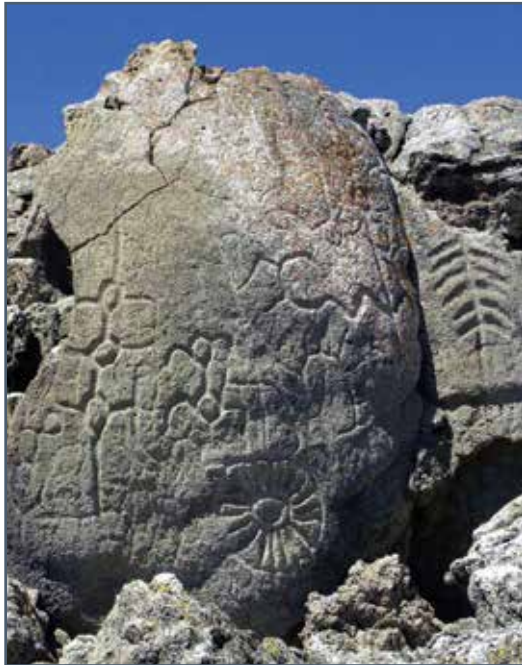
Photo 1 and 2 - Two petroglyph styles from the north and south parts of Nevada. Photo 1 image has obvious bodies drawn in full width whereas Photo 2 petroglyph uses only single lines, a concept I will discuss later.